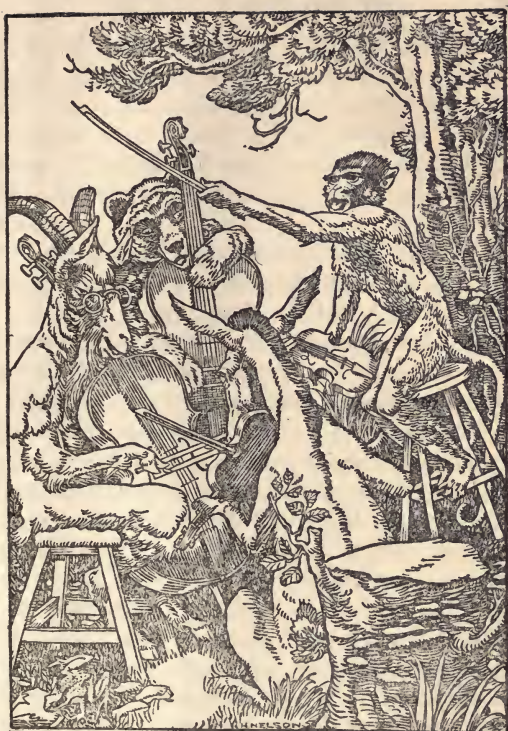
THE TRICKSY MONKEY, THE GOAT, THE ASS AND BANDY-LEGGED MISHKA THE BEAR, DETERMINE TO PLAY A QUARTETTE"